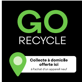
Removal service sticker (5 x 5 po)