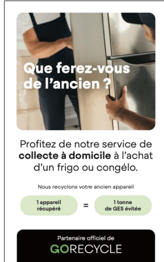
Reusable sticker Adhesive (5 x 8 po)