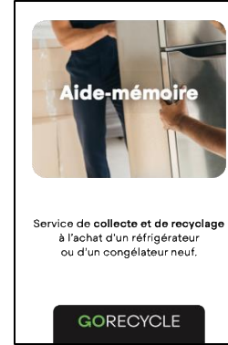
Sales team reminder 3 pages (4 x 6 po)