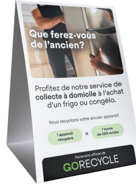
Tent Card For fridge interiors (4.25 x 6.5 po)